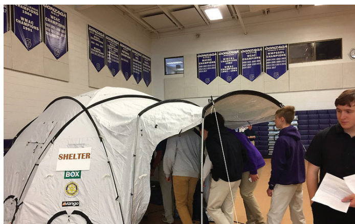
Students at Gonzaga College High School in Washington, D.C. walk through the shelter station during a refugee simulation.

In addition to the toolkit, JRS will provide outreach materials, media support, and advocacy suggestions.