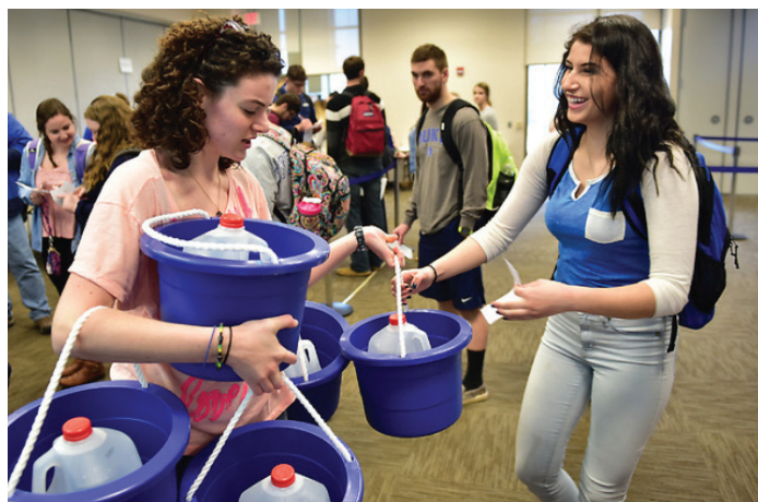
Students at Misericordia University in Pennsylvania get a sense of what it is like to gather and carry water in a refugee camp.